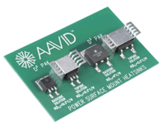
Figure 4. Power devices are fitted with low-profile surface mounted heat sinks.