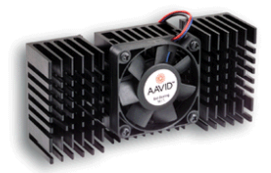
Figure 2. A fan is an integral part of this heat sink designed for cooling the Pentium II.