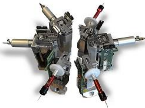
Fully calibrated sensors with temp comp and 24 bit ADC

Sensor ranges were invented to overcome limitations in the conversion of the analog sensor output to a digital output. Less capable Analog to Digital Converters (ADC) have a resolution less than that of the sensor's analog signal. This means their accuracy is dictated by the ADC rather than the sensor. This is particularly bad when measuring low forces. To overcome this limitation ranges are used. Ranges apply the number ADC steps to typically 100%, 50% or 10% of the sensor output. It is a common misconception that ranges improve accuracy. They do not. They simply limit the negative affect of an insufficient ADC capability.