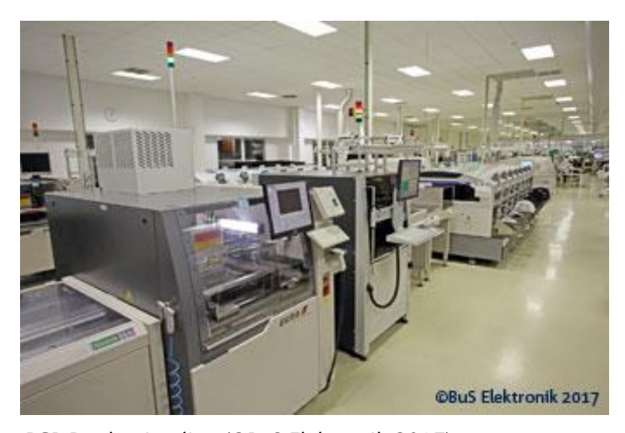
PCB Production line

No matter which soldering process you analyse, all of them have one aspect in common: they produce airborne pollutants, which may have a negative impact on employees, plants and products as well.