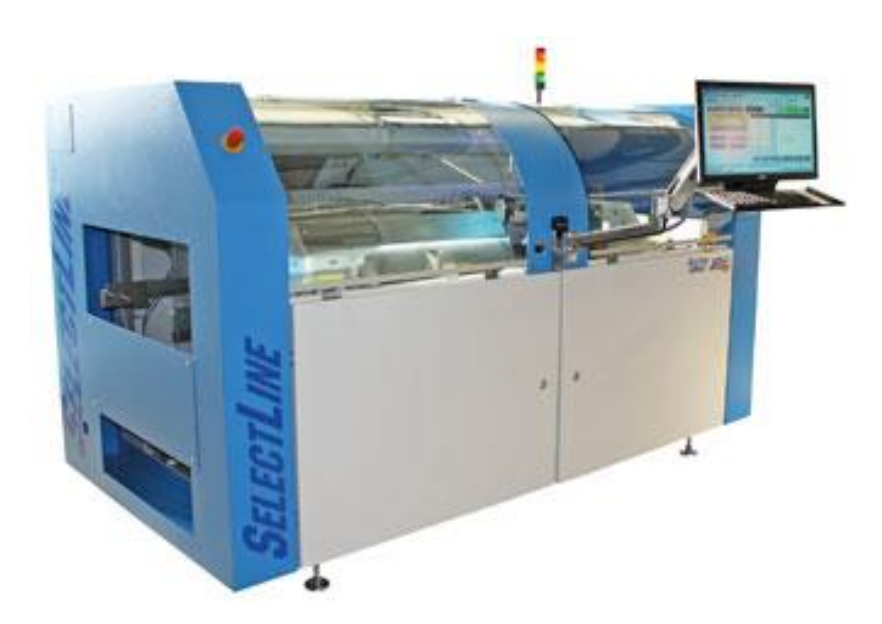
Figure 1: Selective soldering plant

In the production of electronic assemblies, almost only soft soldering is used. The melting temperature of the solder is lower than the melting temperature of the elements to be joined, e.g. component leads to PCB pads – (approx. 180 to 260 °C). The molten solder flows between the metal parts. The objective is to create a firm, airtight, corrosion–resistant, electrically and thermally conductive interconnection. The solder is mostly designed from alloys in the form of solder wire, solder bar or solder paste. Depending on the scope of application of the final product, these alloys are composed of tin, lead, antimony, silver and/or copper. In the solder, fluxing agents can be contained, which are compiled from different chemical