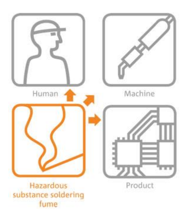
Figure 3: The threefold damaging effect of solder fume

These gases also transport sticky aerosols, which build up in the soldering machines or – even worse – on the products and contaminate them. This leads to increased cleaning and maintenance costs, and the operability of the plant can be impaired. In addition, the manufactured products may even be corroded by the contaminations, which could affect functionality and quality.